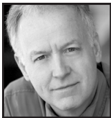
Reed Birney, ('72)

Award Winning Actor, Stage, Film and Television